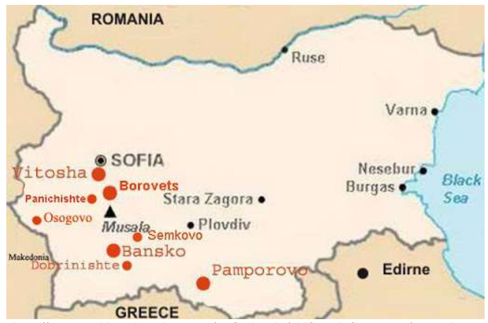
Figure 3 The biggest mountain resorts in Bulgaria

In line with the possibilities for spatial development and the opportunity which Bulgaria has – a new wave of emigration of 25-40 thousand foreigners to enter the country and its impact on the labor market, it would be good through the development of new tourist centers to attract some of the immigrants in order to mitigate the burden on the urbanized areas in Bulgaria. Unfortunately, there is no clear policy on the modernization of resorts like Syutka, Banite (Smolyan district), Belite brezi (close to Ardino), Byala cherkva (Plovdiv district), Laki (the village of Manastir), Panichiste and Separeva banya, Berkovitza, Beklemeto, Yundola and Varshets, where opportunities for building new mountain resorts exist. But for now, a congestion in the existing complexes is observed (Pamporovo, Borovets