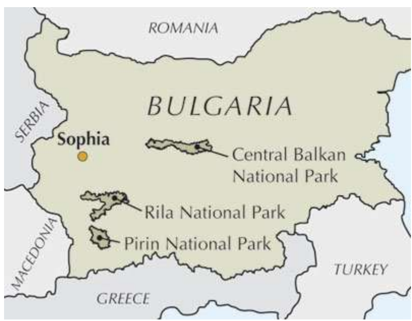
Figure 2 Map of Bulgaria's National Parks

Evolution in environmental thinking and the development of environmental legislation has largely helped, mainly with the introduction of national parks and then national and nature parks. Unfortunately, new reliable territorial plans for the mountain areas have not been developed in the recent years. But on the other hand, the management plans for the national parks "Central Balkan", "Rila" and "Pirin" and the natural park "Vitosha" were prepared.